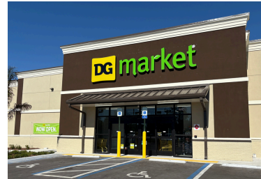
Dollar General 25240 Sandhill Blvd., Punta Gorda Commercial retail store