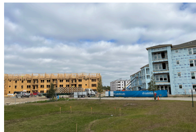
Livano Charlotte Harbor 100 Tamiami Trail, Port Charlotte 333-unit apartment complex with a swimming pool and clubhouse