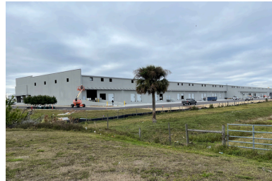
Charlotte Harbor Business Center 9225 Piper Rd., Punta Gorda 139,200 sq. ft. warehousing and distribution development