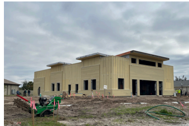
Dr. Shaw Veterinary Facility 27570 Disston Ave., Punta Gorda 6,000 sq. ft. animal clinic